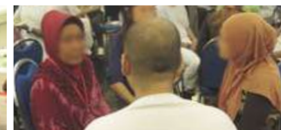
A gathering for inmates and their families, joined by mental health experts and key community partners