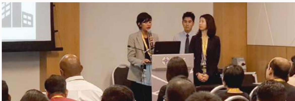
Ms Farhanis presenting an evaluation study at the Yellow Ribbon Conference in 2018

Evaluation is only meaningful when the findings enable stakeholders to make sense of their efforts and plan for their next step. Hence, sharing is facilitated in a myriad of ways that best benefits the stakeholders.