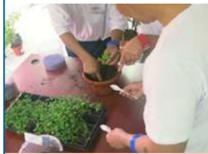
Hands-on learning with plants

PHU initiated the Indoor Gardening Therapy Programme in November 2019 to improve the well-being of OMDs.