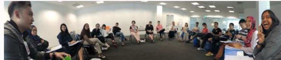
5-day Restorative Practice training conducted by CRSes for Prison Officers in 2019

for officers in skills application on the ground. We also design various regimes and activities to facilitate the conduct of inmates' programmes. We work with stakeholders such as families and community partners to support the reintegration of inmates.