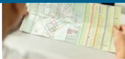
An inmate studying the Mass Rapid Transit map

Nurse educator conducts psychoeducation sessions to coach OMDs in developing personalised strategies and skills to lead functional and fulfilling lives.