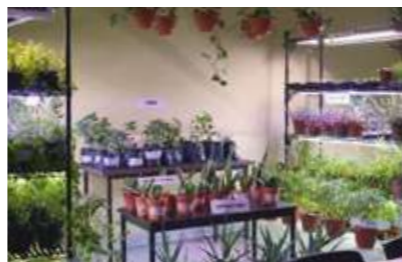
Gardening Therapy with grow lights