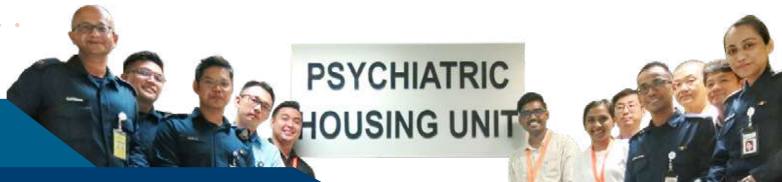
Prison officers, Institute of Mental Health staff and nursing staff in the Psychiatric Housing Unit