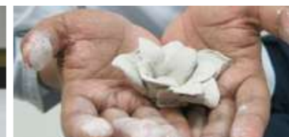
A clay rose done by an inmate