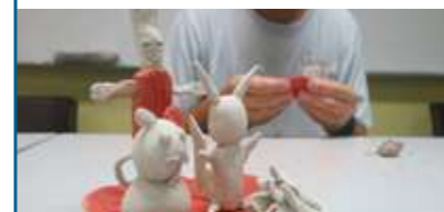
A creative clay piece by an inmate