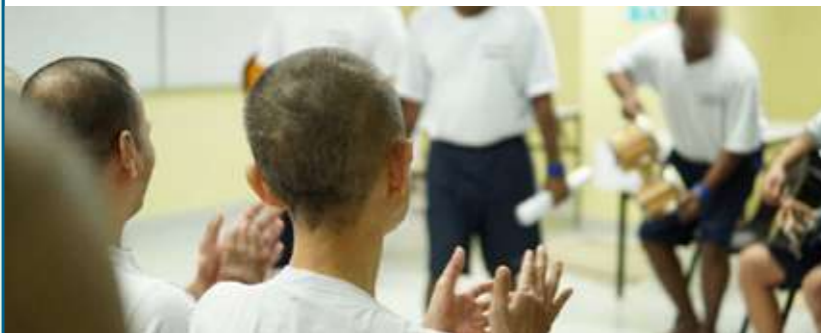
A group of inmates performing a song to celebrate their journey to recovery

The inaugural Recovery Awareness Day held on 7 January 2020 allowed OMDs to share their personal achievements in coping with their mental health issues and aspirations through role-play, songs and testimony sharing.