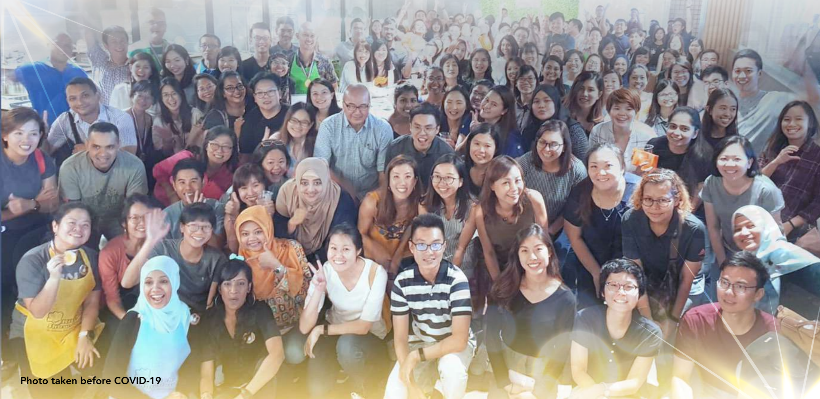
Photo taken before COVID-19