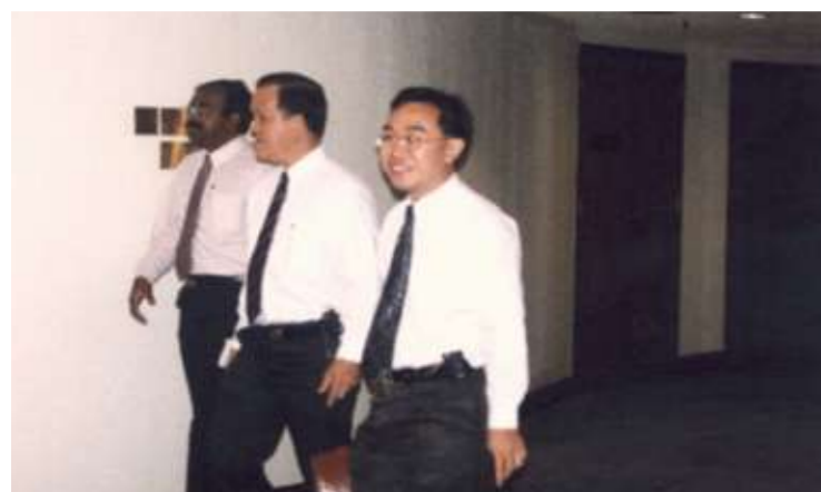
Visit to the old Prison Staff Training School in Sembawang