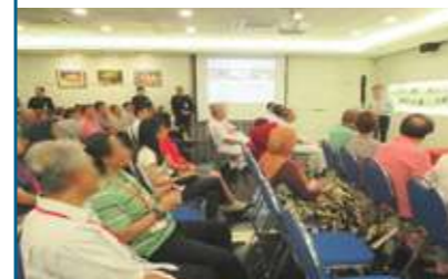
Briefing about Mental Health to inmates and their families

Family members interact with mental health experts and key community partners, to support their caregiving challenges, and strengthen inmates' social support systems.